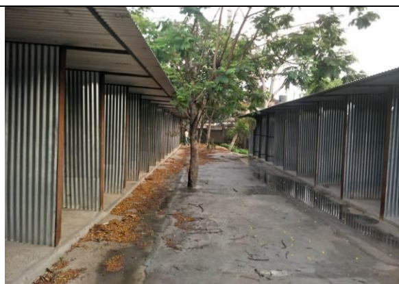
Vending zone is ready in TIN PLATE Vendors will be shifted to this zone. 92 shops have been made and 50 more will be added.