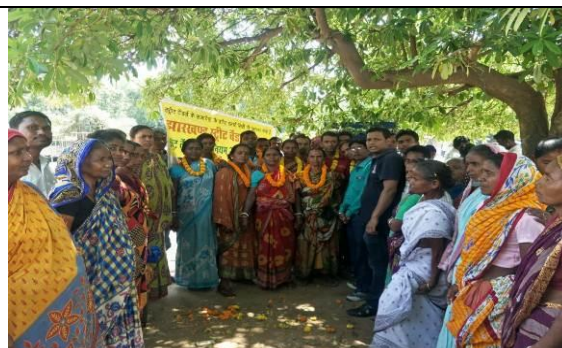
Market Committee was constituted in Baradwari market on 15-05-2019. 167 Vendors were present. Election were held to elect the office bearers.