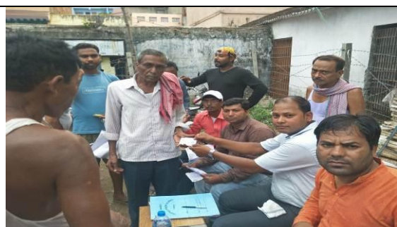
Vending Identity Card have been distributed in Telco Market and necessary documents collected from vendors.

A Meeting was held with CMMU in JNAC. The issue of 50 vendors who were not given place in TIN PLATE was taken up. City Mission Manager took the application and promised to do the needful.