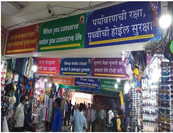
Permanently reinstated Vendors