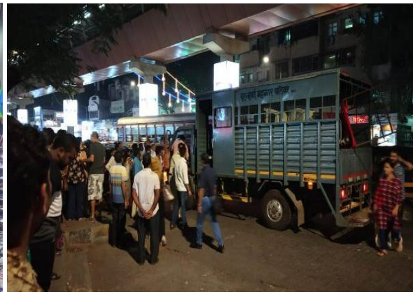
Eviction in Andheri East-Mumbai