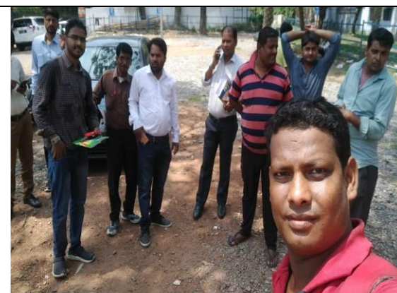
Map is being prepared for vending zone in Jubli Park